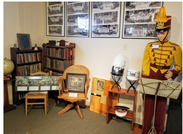
School display spotlighting county schools and students from the past